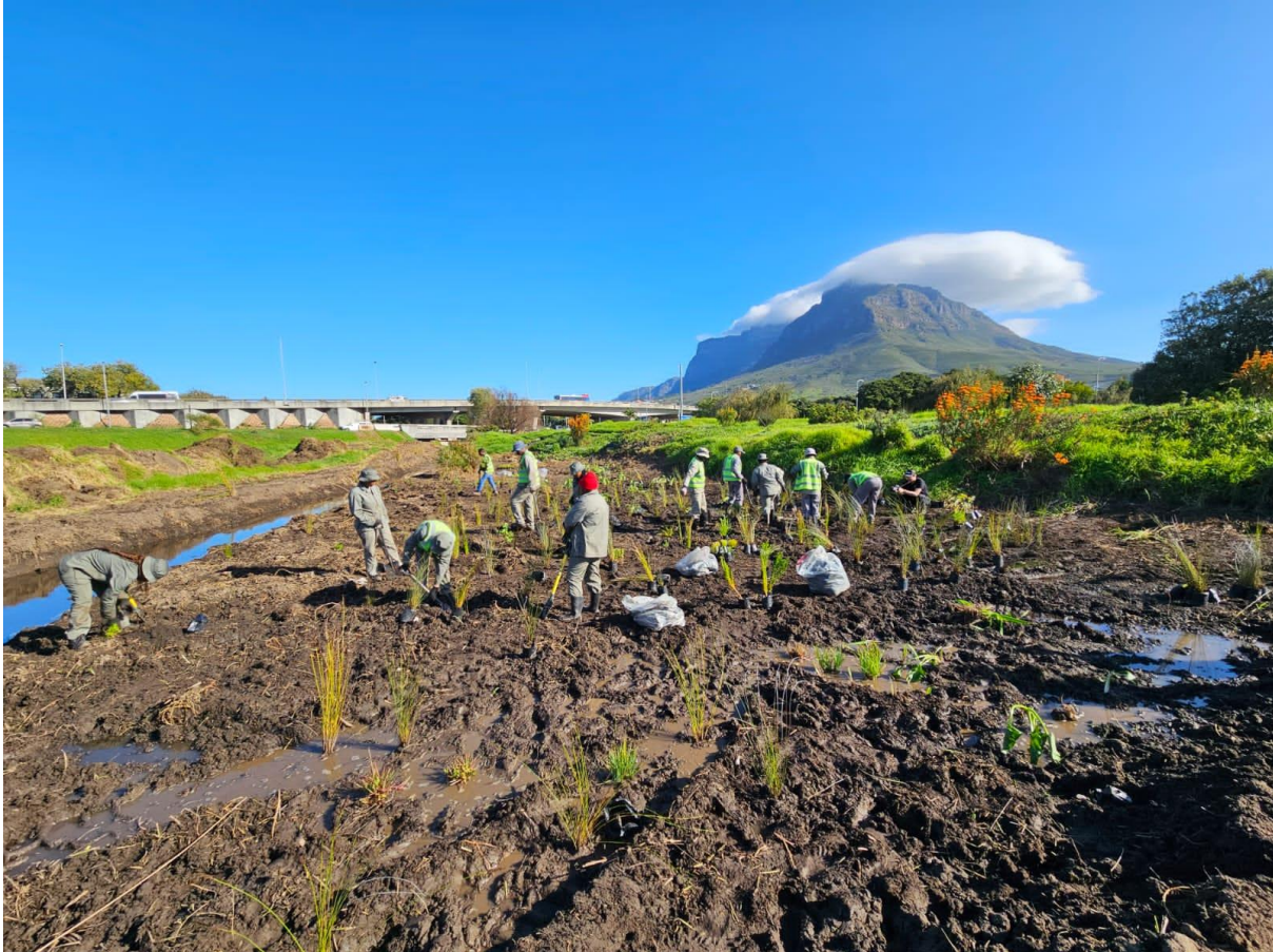
ABOVE: The LMP team planting some obligate and facultative wetland plants at the newly scrapped retention pond.