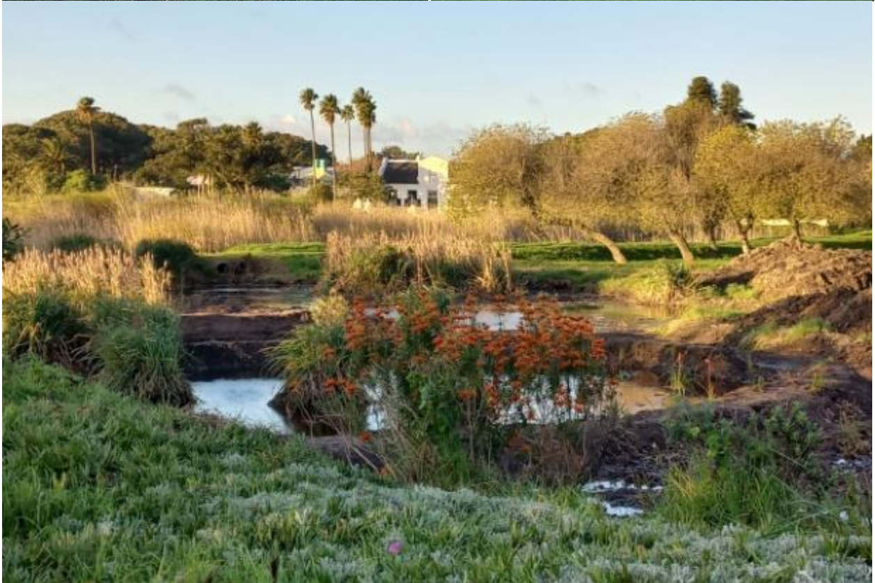
Top Right: A before example of the N2 pond earthworks showing the invasive annual weeds encroachment. Top Left: During the wetlands earthworks. Bottom: Post wetland earthworks, showing the wetland design within the pond. Bottom: (Photos, Sabelo Memani, 2023)