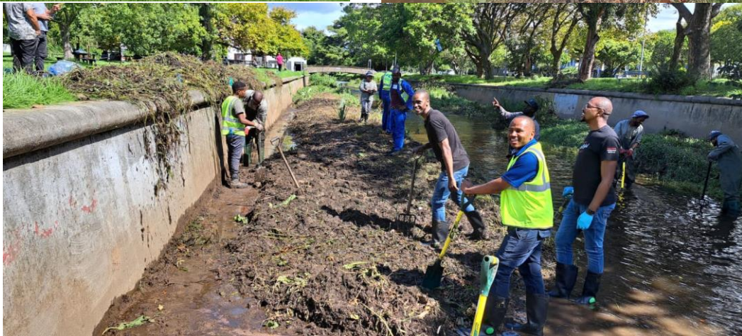
ABOVE: The Team posing for a World Action for Rivers and with the Newlands Brewery staff during the World Water Day celebrations in the month (Photos: Gill Lanham, Lauren (SAB Brewery), 2023).