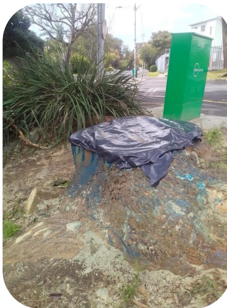
ABOVE: City of Cape Town ISU contracted staff chipping PSHB infested felled trees in Mowbray and a typical depiction of the methods applied post clearing: a blue herbicide was applied and black plastic covering was used to cover the stump.