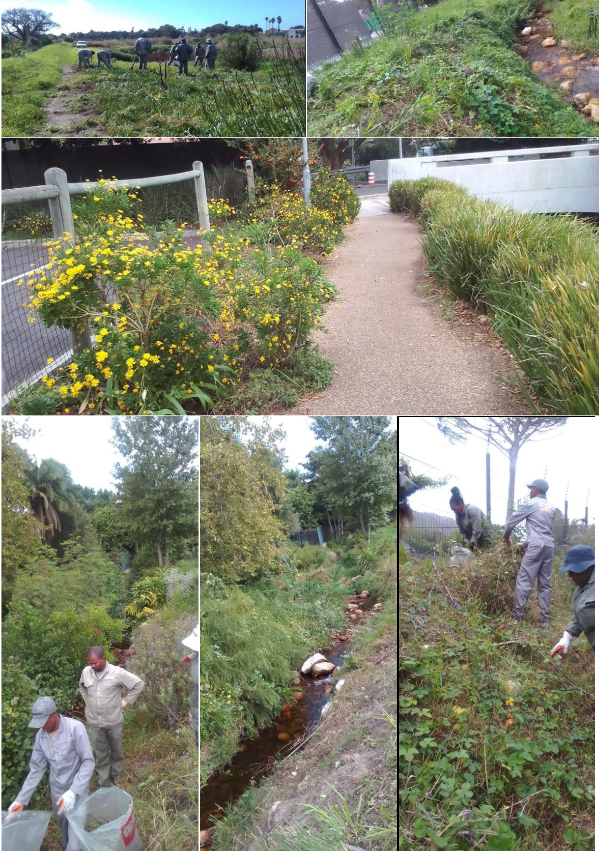
ABOVE: Some examples of the ESI maintenance work completed by the LMP team in April: Top left, ESI maintenance (OBS - Levi's Patch); Top Right; Riverbank maintenance (St Albans CL); Middle: ESI and path maintenance (St Michaels Church); Bottom left; Before river bank vegetation encroachment control; Middle bottom: Post riverbank maintenance (St Albans CL) and bottom right; The LMP team controlling morning glory and Brumble (St Albans CL to ULRG), (Photos: Mncekeleli Klaas and Sabelo Memani, 2023)