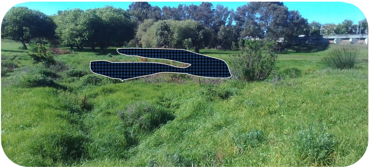
ABOVE: The N2 pond Xanthium and Datura stramonium infestation extent (Photo: Sabelo Memani, 2023).

There were no keynote special projects undertaken in April except the initial clearing of a 30x30m of a thick stand of Xanthium strumarium and Datura stramonium at the N2 pond in preparation for the sites clearing of Pennisetum and Stenotaphrum spp. The LMP team spent at least a day removing the above mentioned species in order to control the seed spread during the excavation process.