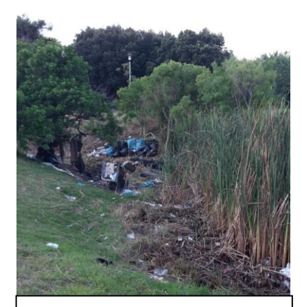
The wetland (20 October), first efforts to remove the reeds (again) exposing the litter

from the Liesbeek River, the soils in wetland began accumulating excess nutrients from stormwater runoff. All the ingredients were in place to change a once pretty wetland into a maintenance problem and a public eyesore. Phragmites reeds took over the wetland, as they do in shallow wetland systems throughout the Western Cape – an indication that they were thriving on the nutrients and actually doing a great job in absorbing pollutants. The familiar sight of a bunch of common reeds is hardly an attractive environment. The public were more displeased when these overgrown areas become the refuge for the homeless along with the excessive litter and general grim that accompanies those living in these conditions. Social factors are integral to understanding constructed wetlands are used and abused, and require dedicated management. It is also important to acknowledge that this wetland did and continues to absorb stormwater contaminants from a section of a formal residential area of Mowbray. The wetland is working, but just as it is being loaded with visible litter largely from homeless people, it is being loaded by contaminated water that is largely unseen.